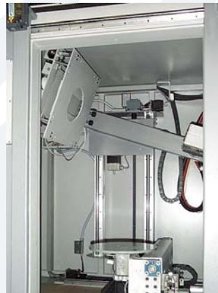
Shown is the C-Arm based manipulator as seen from the opened loading