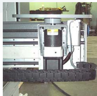
The loading table shown extended out from the loading door for ease of loading heavy parts